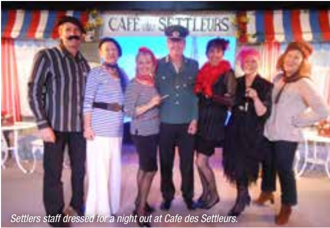
Settlers staff dressed for a night out at Café des Settlers.