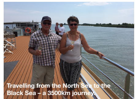
Travelling from the North Sea to the Black Sea - a 3500km journey.